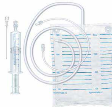
pleura set ARV