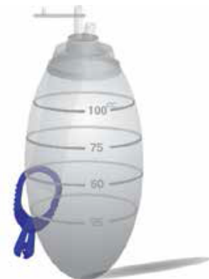
Silicone secretion reservoir