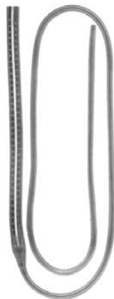
Silicone drainage tubing