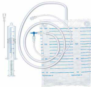
pleura set DWH