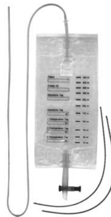
Gravity wound drainage system